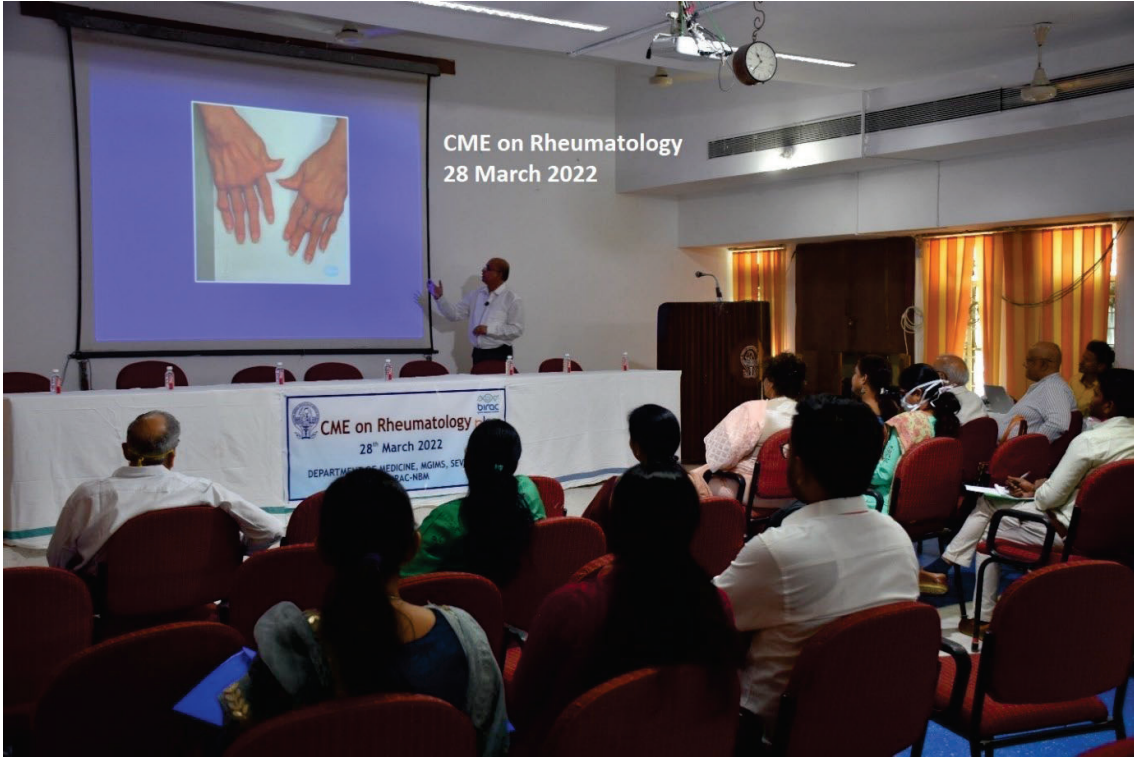
CME on Rheumatology 28 March 2022