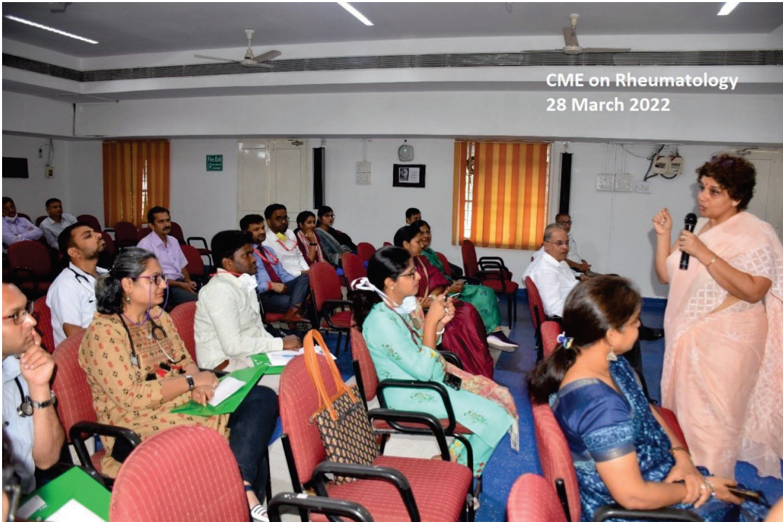
CME on Rheumatology 28 March 2022